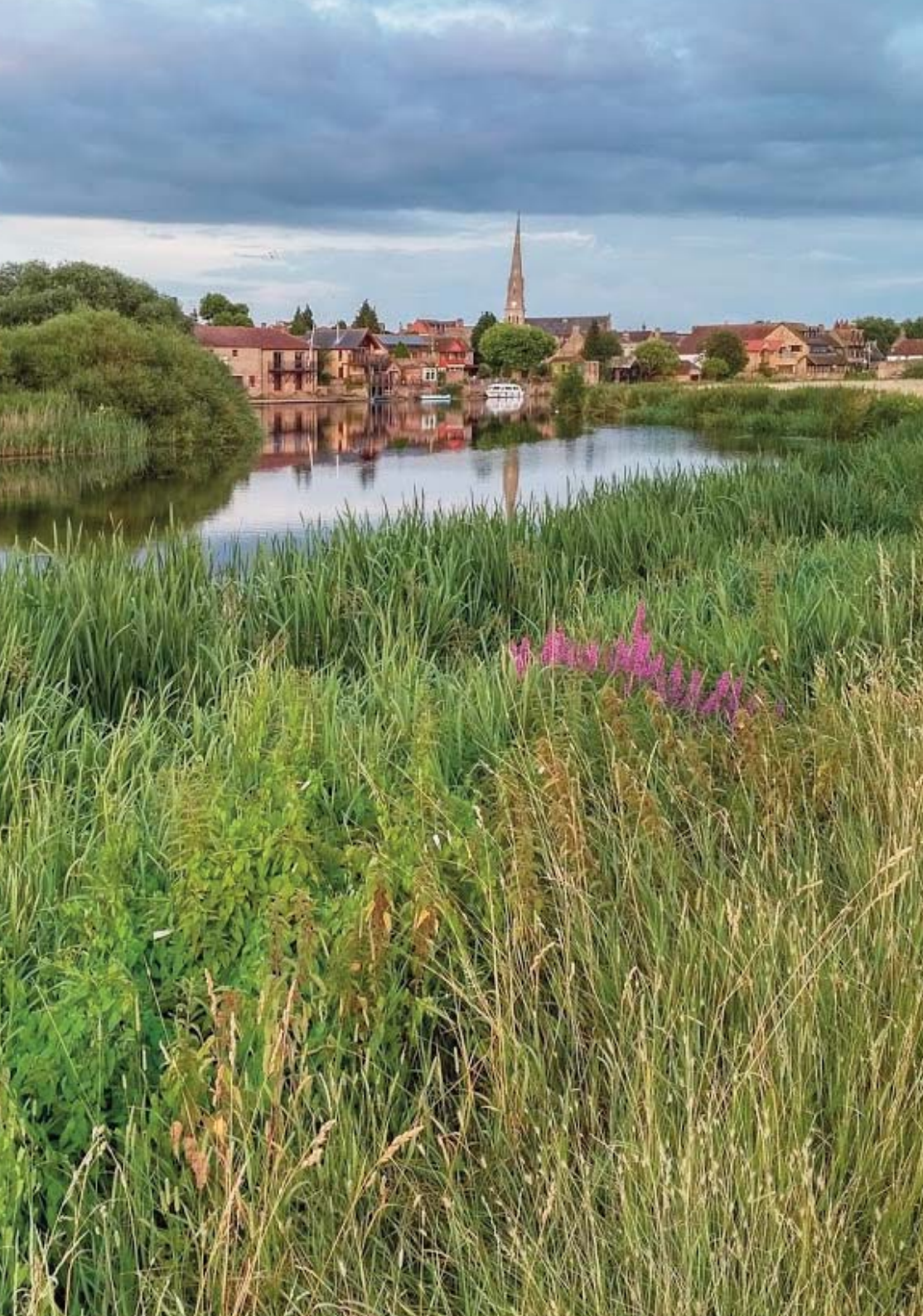
Great Ouse, St. Ives